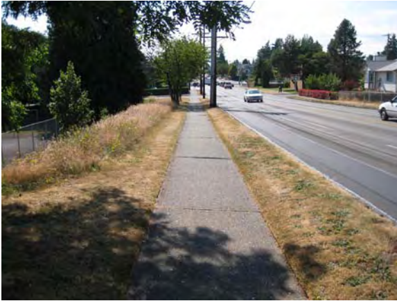
S. 12th St. looking west