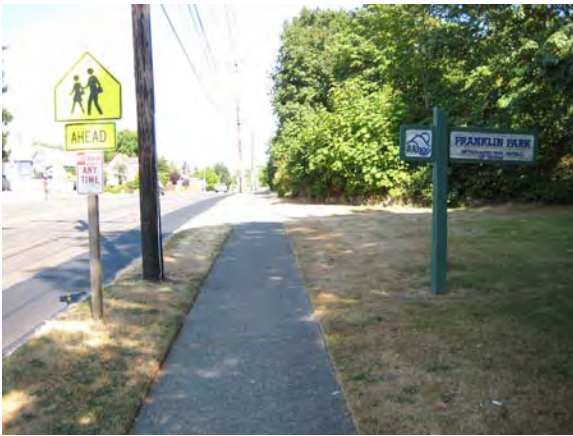
S. 12th St. looking east