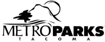
Exhibit A to Resolution R