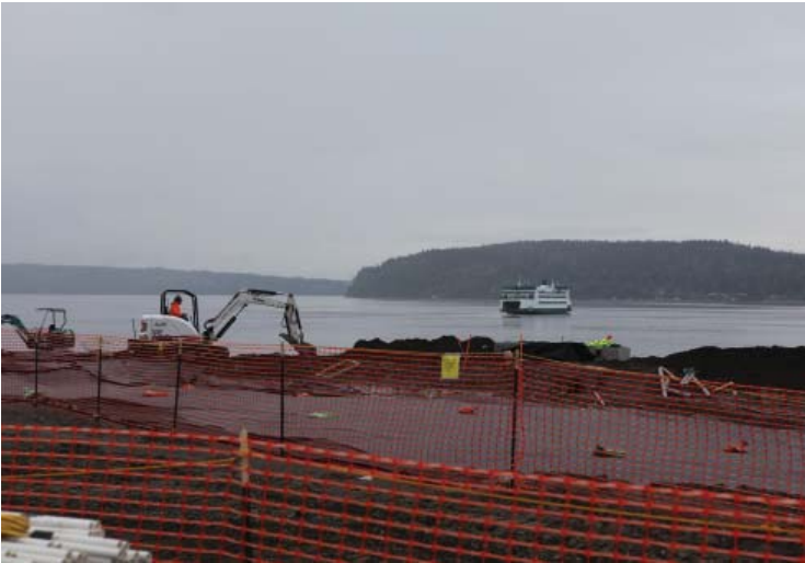
Peninsula: Liner along Reach B is being installed along with crushed rock around the Tacoma Yacht Club parking lot.

Metro Parks Tacoma is improving Point Defiance Park as part of the voter-approved 2014 capital bond.* All park attractions remain open as progress continues on multiple projects.