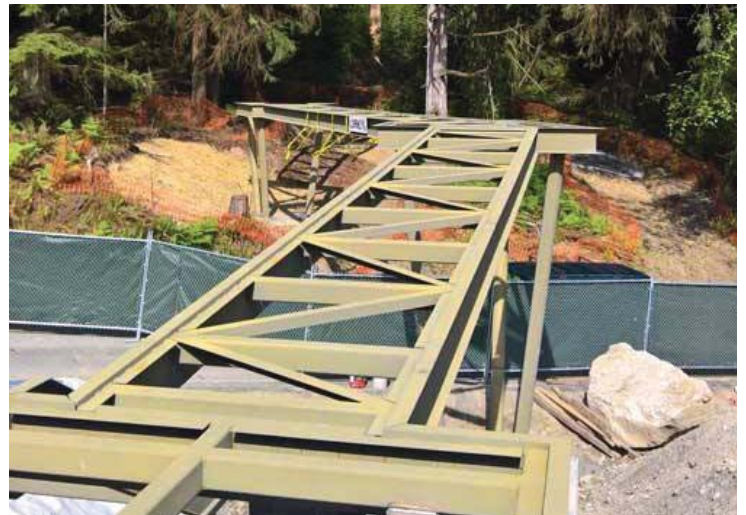
Environmental Learning Center: This steel structure will become a pedestrian bridge connecting the learning center with nearby Point Defiance trails.