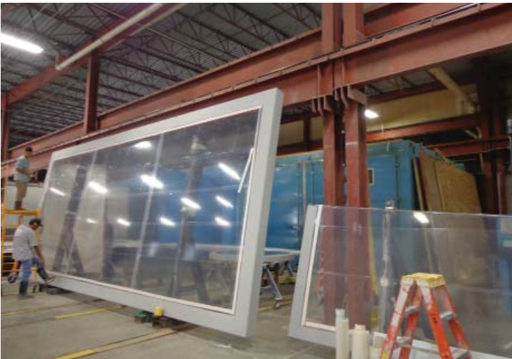
Pacific Seas Aquarium: Image of Northwest Waters & surge tank acrylic. Work continues with concrete work on perimeter walls, tank walls and exterior stairs.