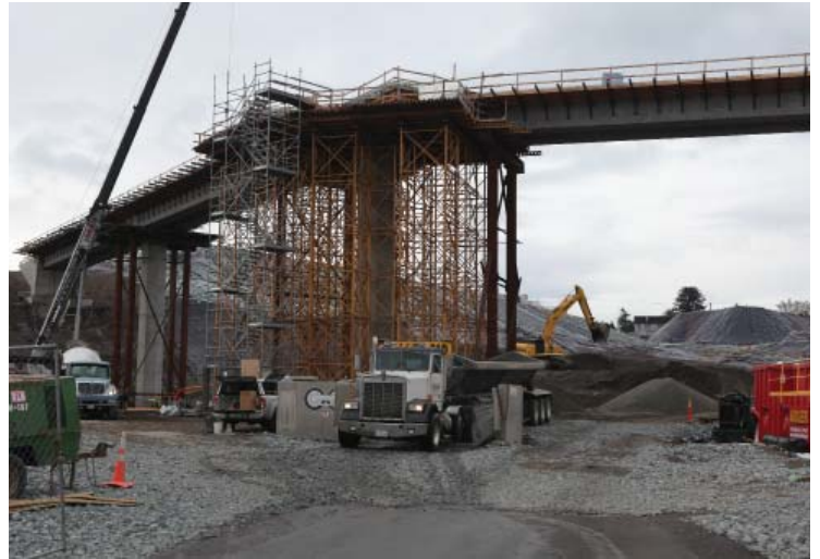
Wilson Way: Crews are working on bridge closures, curbs, and placing the pier 1 approach slab.